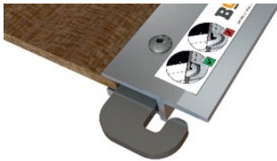
Latch Detail View