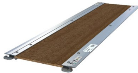
Infill Deck MK 2 - Cantilever