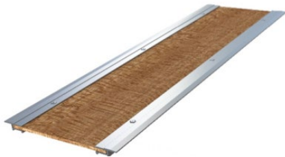
Infill Deck MK 1 - Cantilever

We are pleased to announce the latest upgrade to the BoSS Product range with the introduction of the new Infill Decks. Suited for use in advanced tower builds the infill decks are designed to fit effortlessly between the deck boards and create a secure assembly between each deck unit. To improve the performance of the decks wind latches have been added. The latches on the infill deck fix directly into the end of the adjacent decks, where the end caps are removed, enabling the user to position the deck securely. These upgraded components are designed for use within structures that are compliant with BS1139-6:2014.